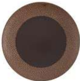
Brown Dinner Plate TC7701.DV.7.803 10.75" (27.3cm)