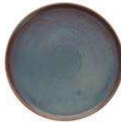
Plate 6600.SND.11078 10.5" (26.67cm)