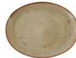
Platters TC7300.DV.4.29 15.25x11.75" (38.5x29.5cm) TC7300.DV.4.28 13x10" (33x25cm)