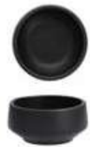
Bowl 3100.BLK.02 4x2", 7.5oz (10.5x5.5cm, .22L)