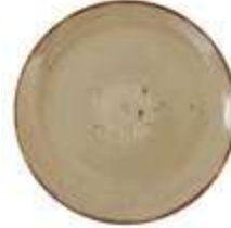
Plate TC7300.DV.4.803 10.75" (27.5cm)