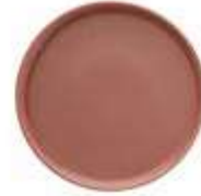
Fitted Plates 6800.SND.1109 8.5" (21.6cm) fits 8.5" bowl 6800.SND.1156 6" (15.2cm) fits 6" bowl