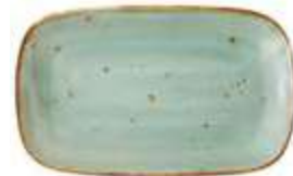
Platters TC7300.DV.5.60 14x9" (35.5x23cm) TC7300.DV.5.58 11x7" (28x17.5cm)