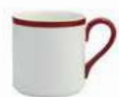
Amanda Burgundy Stack Mug 7200.FFD.888 12oz (.35L)