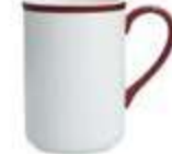
Amanda Burgundy Mug 7200.FFD.03 12oz (.35L) CR20-I-125T**