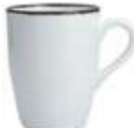
Pepper Tapered Mug TC7400.DV.5.17 12.8oz (.38L) CR16-I-125T*