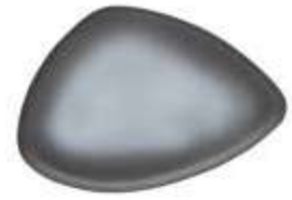
Duke Variegated Platter CT.0216.33 13x9" (33x22.9cm)