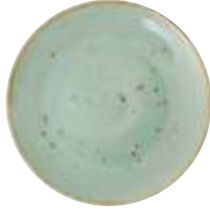
Plate TC7300.DV.5.803 10.75" (27.5cm)