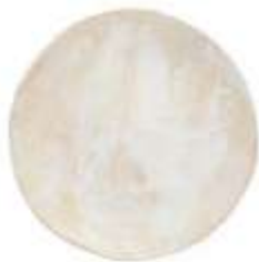
Ines Dinner Plate CT.2.WH.INES.27 10.75x1" (27x2.5cm)