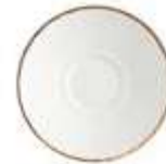
Salt Saucers TC7400.DV.4.16 7" (18cm) cappuccino TC7400.DV.4.05 6.25" (16cm) coffee TC7400.DV.4.07 4.75" (12cm) espresso