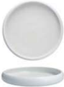
Arlo Variegated Bowls CT.0115.28 11x2" (28x5.1cm) CT.0112.24 8.5x1.5" (21.6x12.7cm) CT.0112.15 6x1" (15.2x2.5cm)