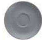
Sound Cement Saucers 6500.SND.4615 5.5" (14cm) coffee 6500.SND.4627 4.5" (11.4cm) espresso