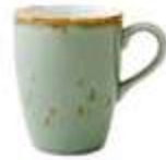
Tapered Mug TC7300.DV.5.17 12.75oz (.38L) CR16-I-125T*