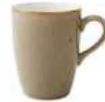
Tapered Mug TC7300.DV.4.17 12.75oz (.38L) CR16-I-125T*