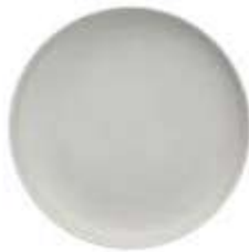
Coupe Plate 3300.70198.1GY 11x1.4" (28.0cm)