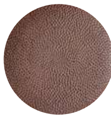
Brown Accent Plates TC7700.DV.7.804 8.25" (21cm) TC7700.DV.7.806 6.5" (16.5cm)