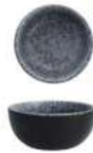
Square Dish 6000.GLC.1072 3.5", 4oz (9cm, .12L)