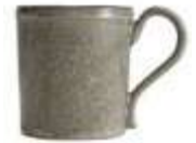
Stön™ Mist Mug 5900.GRY.5465 9oz (.27L) CR16-S-115T*