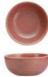
Bowl 6800.SND.1378 6", 24oz (15.2cm, .71L)