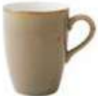
Erthe™ Shiitake Tapered Mug TC7300.DV.4.17 12.8oz (.38L) CR16-I-125T*