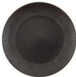
Black Dinner Plate TC7701.DV.6.803 10.75" (27.3cm)