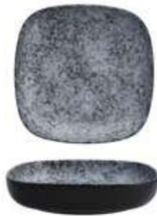
Square Bowls 6000.GLC.1061 8.75", 35oz (22cm, 1L) 6000.GLC.1085 5.75", 20oz (15cm, .6L)