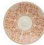
Havana Adobo Universal Saucer STN.5604.05 6.25" (12.1cm)