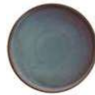
Fitted Plates 6600.SND.1109 8.5" (22cm) fits 8.5" bowl 6600.SND.1156 6" (15.2cm) fits 6" bowl