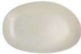
Oval Platters 5900.CRM.3914 14" (36cm) 5900.CRM.3911 11" (28cm)