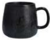
Sound Midnight Mug 5900.BLK.5465 14oz (.41L) CR16-S-115T*