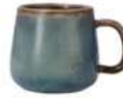
Sound Oxide Mug 6600.SND.1197 14oz (.41L) CR16-S-115T*