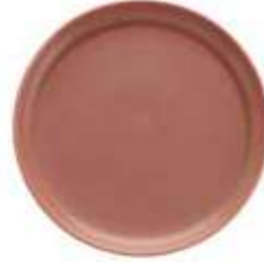
Coupe Plate 6800.SND.1341 10.5" (26.7cm)