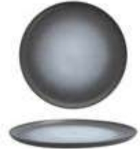
Miles Variegated Plate CT.0213.25 10x5" (25.4x1.27cm)