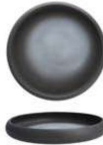
Arlo Variegated Bowls CT.0215.28 11x2" (28x5.1cm) CT.0212.24 8.5x1.5" (21.6x12.7cm) CT.0212.15 6x1" (15.2x2.5cm)