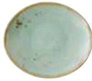
Samba Platters TC7300.DV.5.222 8.5x7.5" (21.5x19cm) TC7300.DV.5.217 6.75x6" (17x15cm)