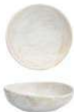
Tomas Bowl CT.2.WH.TOMA.15 6x1.75", 13.5oz (15.2x17.8cm, .4L)