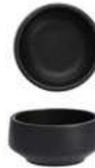
Bowl 3100.BLK.03 5x2", 12.5oz (12.5x5.5cm, .34L)