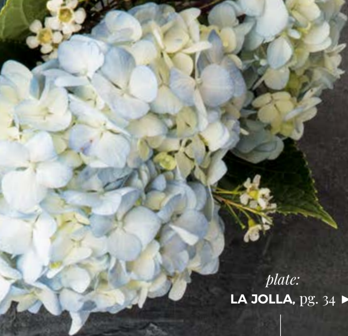
plate: LA JOLLA , pg. 34 ▶