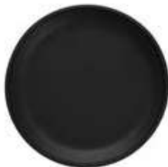
Plate 3100.BLK.06 10" (26cm)