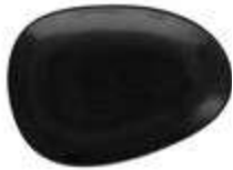
Oval Platter 5900.BLK.3908 8" (20.3cm)