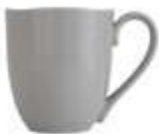
Heirloom Smoke Tapered Mug STN.8000.5.17 11.5oz (.34L) CR16-S-115T*