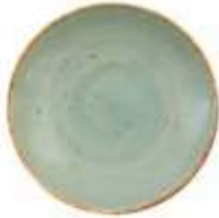
Bowl TC7300.DV.5.98 10.25", 32oz (26cm, .95L)