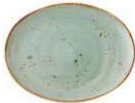
Platters TC7300.DV.5.29 15.25x11.75" (38.5x29.5cm) TC7300.DV.5.28 13x10" (33x25cm)