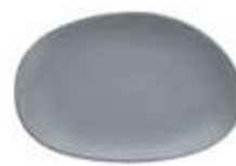
Oval Platter 5900.CMT.3908 8" (20.3cm)