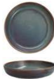
Pasta Bowl 6600.SND.1339 8.5", 28oz (21.6cm, .8L)