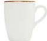
Salt Tapered Mug TC7400.DV.4.17 12.8oz (.38L) CR16-I-125T*