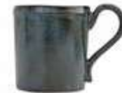
Stön™ Twilight Mug 5900.BLU.5465 9oz (.27L) CR16-S-115T*