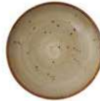
Bowl TC7300.DV.4.98 10.25", 32oz (26cm, .95L)