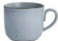
Aether Mug 4100.F0000.01 14oz (.4L)