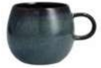
Northern Lights Aurora Blue Mug STN.1100.17 16.5oz (.49L) CR9-S-115*