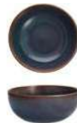
Bowl 6660.SND.1378 6", 24oz (15.2cm, .7L)