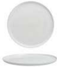
Miles Variegated Plate CT.0113.25 10x5" (25.4x1.27cm)