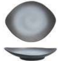
Nora Variegated Bowl CT.0212.25 10x9x2" (25.4x22.9x5.1cm)