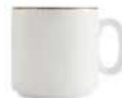
Salt Stackable Mug TC7400.DV.4.08 9.5oz (.28L)