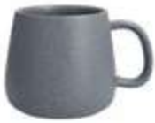
Sound Cement Mug 6500.SND.1197 14oz (.41L) CR16-S-115T*