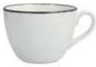
Pepper Doppio, Breakfast Cup TC7400.DV.5.09 14oz (.41L) CR20-I-125T*