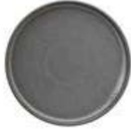
Fitted Plates 6700.SND.1109 8.5" (21.6cm) fits 8.5" bowl 6700.SND.1131 6.75" (17.1cm) fits 6.75" bowl 6700.SND.1156 6" (15.2cm) fits 6" bowl