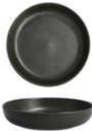
Pasta Bowl 6300.SND.1339 8.5", 28oz (21.6cm, .8L)