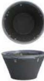
Lena Variegated Bowl CT.0215.23 9x5", 82oz (22.9x12.7cm, 2.43L)