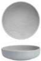
Bowl 3300.52514GY 7.8x2", 40oz (20x5.5cm, 1.2L)