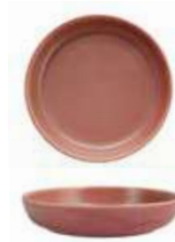
Pasta Bowl 6800.SND.1339 8.5", 28oz (21.6cm, .83L)