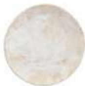
Mateus Side Plate CT.2.WH.MATE.18 7.25x.5" (18.4x1.27cm)