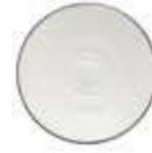
Pepper Universal Saucer TC7400.DV.5.04 6" (15cm)