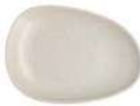
Oval Platter 5900.CRM.3908 8" (20.3cm)