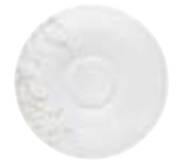
Jasmine Saucer RRP.JASMINE.05 6.25" (16cm)