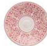
Havana Rose Universal Saucer STN.5605.05 6.25" (12.1cm)