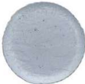
Coupe Plate 4100.F0000.02 10" (25cm)