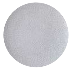
Gray Accent Plate TC7700.DV.5.804 8.25" (21cm)