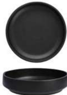
Bowls 3100.BLK.05 15.5x2.5" (39x6cm) 3100.BLK.04 12x2.5" (30x6cm)