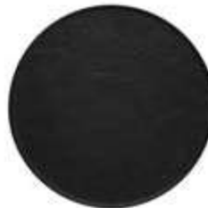
Plates 3300.70171BK 12" (30.0cm) 3300.70172BK 8.6" (22.0cm)