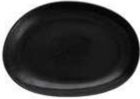
Oval Platters 5900.BLK.3914 14" (36cm) 5900.BLK.3911 11" (28cm)