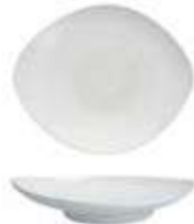
Nora Variegated Bowl CT.0112.25 10x9x2" (25.4x22.9x5.1cm)