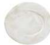
Claudia Universal Saucer CT.2.WH.CLAU.16 6.25x6" (15.9x15.2cm)