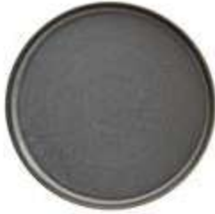
Plate 6700.SND.1178 10.75" (27.3cm)