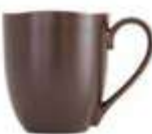
Heirloom Cocoa Tapered Mug STN.8000.7.17 11.5oz (.34L) CR16-S-115T*