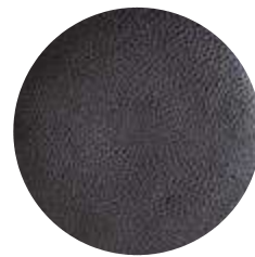
Black Accent Plate TC7700.DV.6.804 8.25" (21cm)