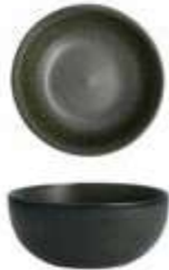
Bowl 6300.SND.1378 6", 24oz (15.2cm, .7L)