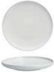
Hugo Variegated Coupes CT.0112.10 10.75x1.75" (27.3x4.4cm) CT.0112.23 8.5x1.75" (21.6x4.4cm)