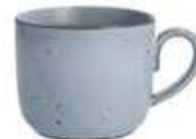
Mug 4100.F0000.01 14oz (.4L)