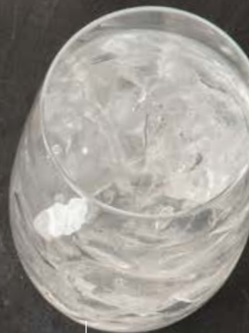
barware: CONVENTION , pg. 356 ▶