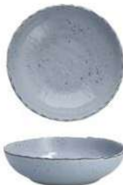
Coupe Bowl 4100.F0000.03 9.25", 58oz (23.5cm, 1.7L)