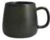
Sound Forest Mug 6300.SND.1197 14oz (.41L) CR16-S-115T*