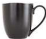
Heirloom Charcoal Tapered Mug STN.8000.6.17 11.5oz (.34L) CR16-S-115T*