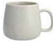
Sound Almond Mug 5900.CRM.5465 14oz (.41L) CR16-S-115T*