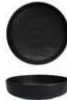
Bowl 3300.52514BK 7.8x2", 40oz (20x5.5cm, 1.2L)