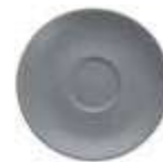
Coffee Saucer 6500.SND.4615 5.5" (14cm)