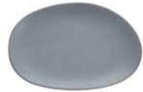
Oval Platters 5900.CMT.3914 14" (36cm) 5900.CMT.3911 11" (28cm)