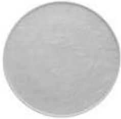
Plates 3300.70171GY 12" (30.0cm) 3300.70172GY 8.6" (22.0cm)