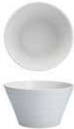
Lena Variegated Bowl CT.0115.23 9x5", 82oz (22.9x12.7cm, 2.43L)