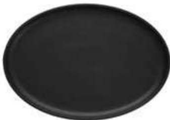
Oval Serving Platter 3100.BLK.01 14.25x10" (36x25cm)