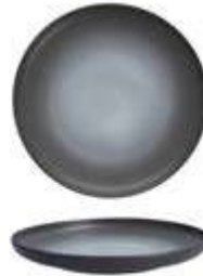
Hugo Variegated Coupe CT.0212.10 10.75x1.75" (27.3x4.4cm) CT.0212.23 8.5x1.75" (21.6x4.4cm)