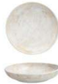
Camila Bowl CT.2.WH.CAMI.20 8x2", 17oz (20.3x5.1cm, .5L)