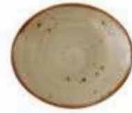
Samba Platters TC7300.DV.4.222 8.5x7.5" (21.5x19cm) TC7300.DV.4.217 6.75x6" (17x15cm)