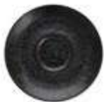
Coffee Saucer 5900.BLK.4615 5.5" (14cm)