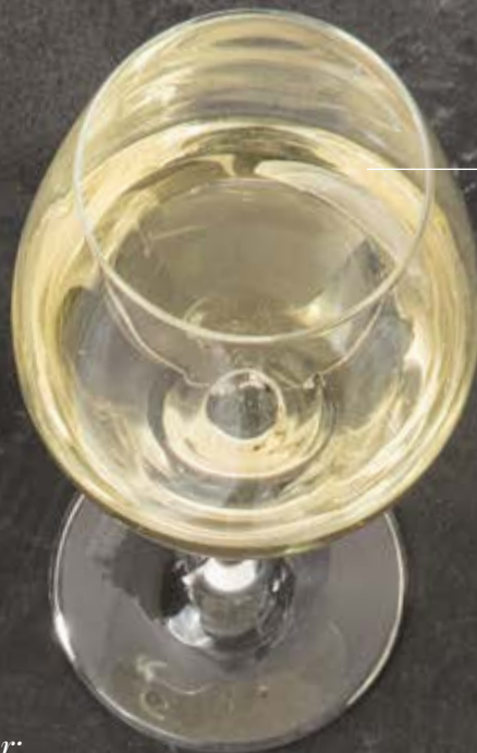
stemware: SENSA , pg. 332 ▶