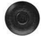
Sound Midnight Saucers 5900.BLK.4615 5.5" (14cm) coffee 5900.BLK.4627 4.5" (11.4cm) espresso