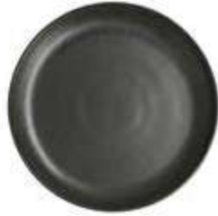
Coupe Plates 6300.SND.1341 10.5" (26.7cm) 6300.SND.1340 8.25" (21cm) 6300.SND.1660 6" (15.2cm)