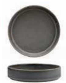
Straight Sided Bowls 6700.SND.1119 8.5" (21.6cm) 6700.SND.1123 6.75" (17.1cm) 6700.SND.1108 6" (15.2cm)