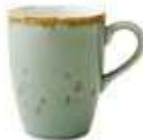
Erthe™ Celadon Tapered Mug TC7300.DV.5.17 12.8oz (.38L) CR16-I-125T*