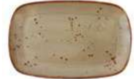
Platters TC7300.DV.4.60 14x9" (35.5x23cm) TC7300.DV.4.58 11x7" (28x17.5cm)