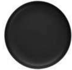
Coupe Plate 3300.70198.1BK 11x1.4" (28.0cm)