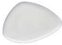
Duke Variegated Platter CT.0116.33 13x9" (33x22.9cm)